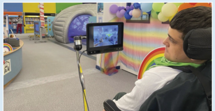
Drive your wheelchair with your eyes using Ability Drive