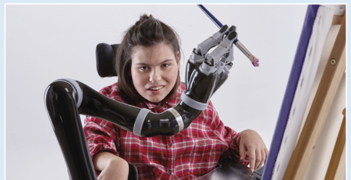
With the JACO robotic arm, you can interact with the world again