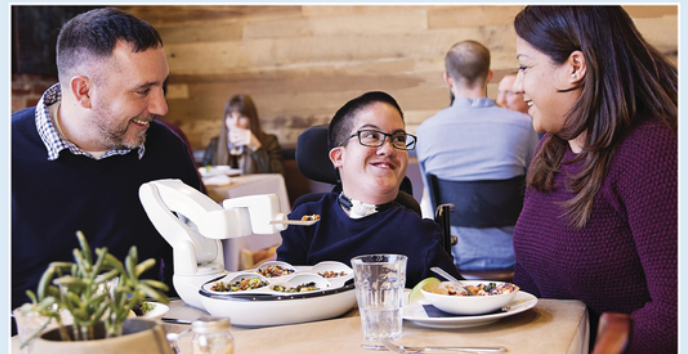
Eating is fun with the OBI dining companion

Come and say Hi on Stand F4, K2A Middle, Thursday 14th March 2024 · 9:30am to 4pm