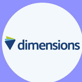
Speakers details to be announced (Stand V17)